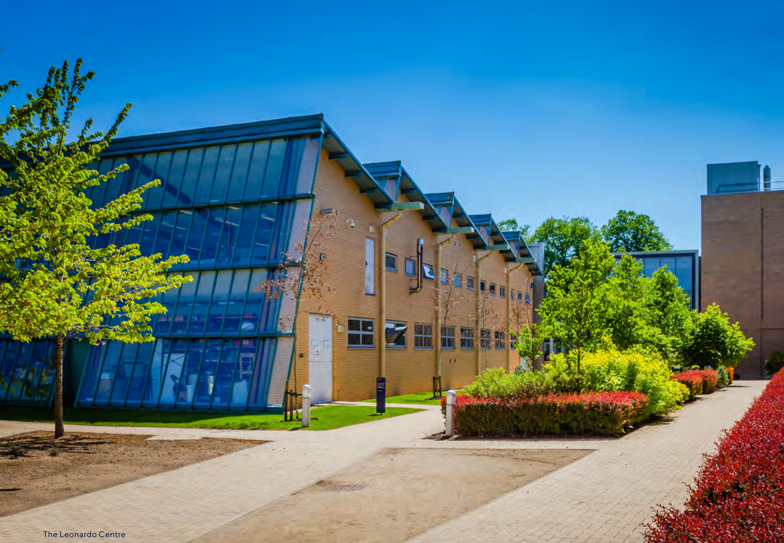
The Leonardo Centre

Uppingham School Uppingham, Rutland LE15 9QE United Kingdom